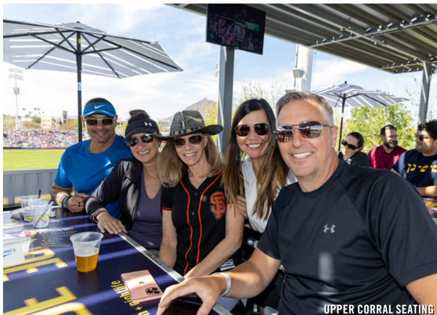
UPPER CORRAL SEATING

A Spring Training Baseball game in shaded comfort of the Scottsdale Charro Lodge, a VIP experience within Scottsdale Stadium. Your Charro Lodge access includes general admission to the game, an outstanding view from patio-style seating adjacent to the San Francisco Giants' bullpen, and complimentary food and beverages. Reserve your season table today.