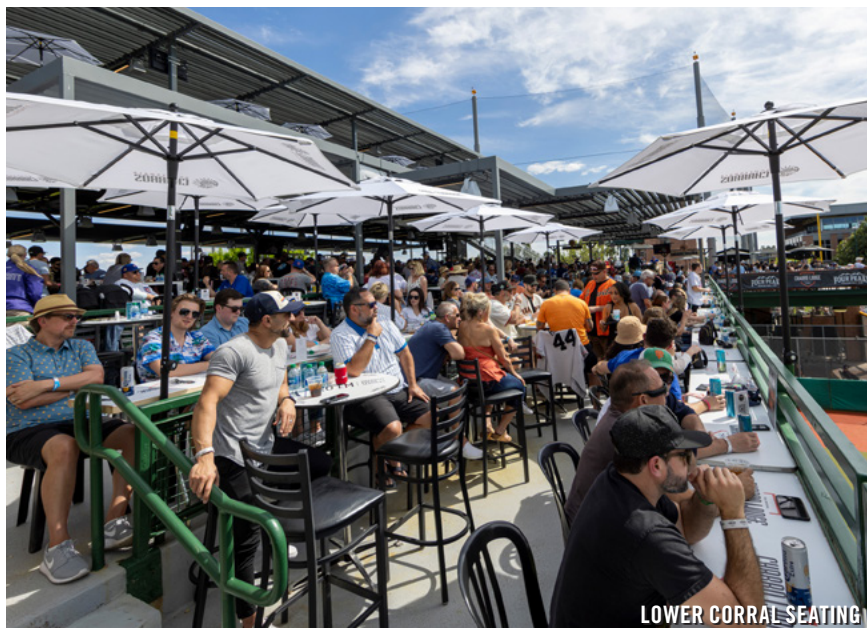
LOWER CORRAL SEATING